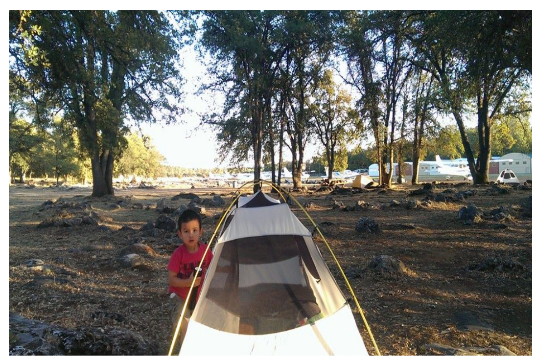
Brett's son, watching over the tent in the camping area at Columbia.

And Columbia has a farmer's market! On Wednesdays and Saturdays (noon-6 pm), Mountain People Organics is right next to the FBO and is an enclosed space with a complete line-up of fresh produce, wood-fired pizza, chocolates, and hippy-dippy sundries. And they have kale! So grab your trendy reusable shopping bag fly yourself up to get your kale, sprouted greens and kombucha.