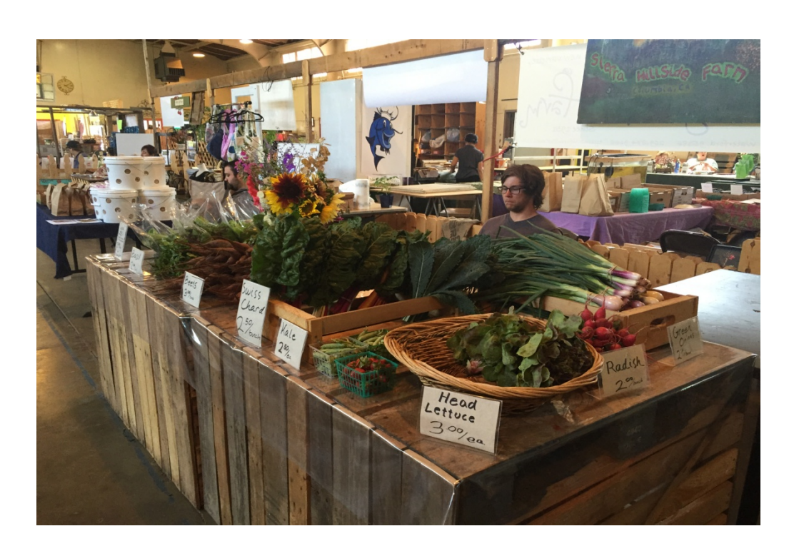
Kale, and other barely edible greens.