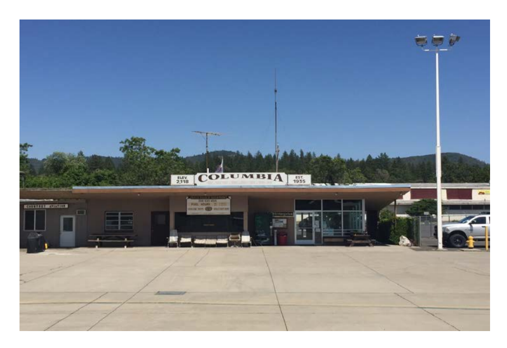
The FBO, with the Farmer's Market building beyond.