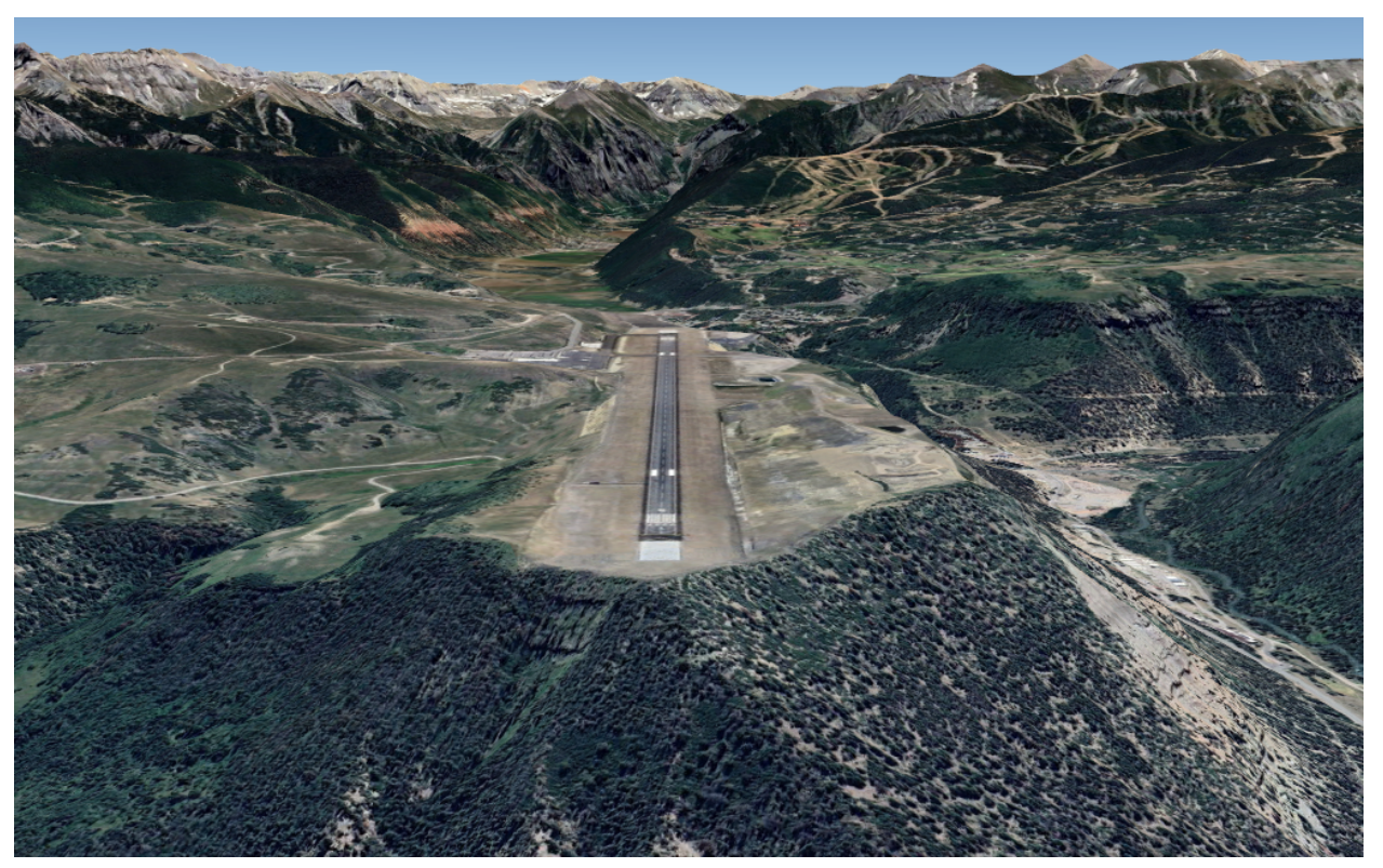
Telluride airport (Google Earth screenshot)

Once again, we got an earlyish start. My log shows the airplane moving at 8:01 am. The flight was short, just 65nm. We climbed to 11.5K and cut the corner on the mountain shoulder that forms the southern edge of the Telluride canyon. One could enter the pattern here but given the nearby mountains it seemed like straight-in was the thing to do. Winds were light as predicted and there were no squirrely up- or down-drafts coming off the sides of the mountain. The view of the airstrip on the approach is dramatic, as it sits on a mesa jutting out from the valley floor to the east. Here's the Google Earth view.