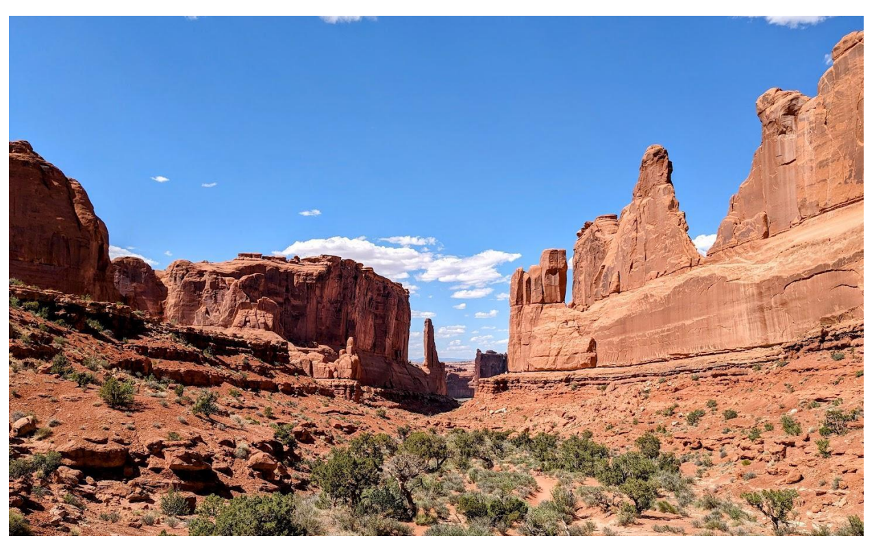
"Park Place" at Arches NP

The FBO ramp rat had suggested that we visit Druid Arch in Canyonlands, which was tempting because <u>druids: no one knows who they were or what they were doing</u>. But it turned out to be almost a 2 hr drive to the trailhead, so we did Devil's Garden in Arches instead.