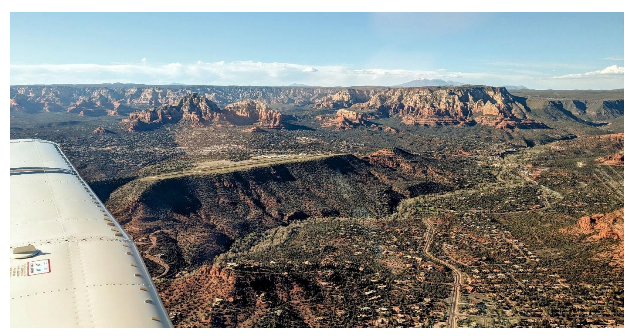
Sedona airstrip on the downwind looking west after departing runway 21.

Our next stop was GCN, a towered airport about ten miles from the south rim of the Grand Canyon, on the edge of the town of Tusayan by the national park entrance. We wanted to overfly the Canyon on the way, and decided to wait until the light was steeper and redder and the shadows deeper, so we did a walk around the airport mesa – there's a hiking trail making a full loop just below the rim – before continuing. Taking off at 5, we flew east first to circle around the meteor crater near Winslow, then northwest past Flagstaff and over some cinder cones north of Humphrey Peak (12.6K), then crossed the Canyon twice, northbound in the Zuni corridor and southbound in the Dragon corridor. The GC is a "special flight rules area" (SFRA) where GA aircraft are excluded from large zones, permitted only in narrow, roughly N/S corridors at specific altitudes.