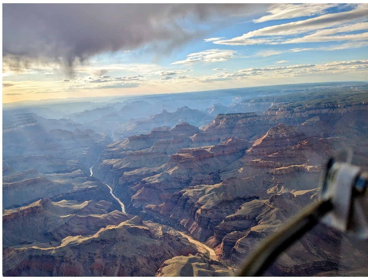
Grand Canyon overflight

The next morning, we walked back to the airport to pick up our exorbitant car rental at the FBO. (We didn't want to pay for two days at the ridiculous price.) We headed into the park, parking near the South Kaibab trailhead and hiking down to Tip Off point, where we rested & had lunch before returning up the trail. The elevation change is about 3,300' and it was warm, so we were glad to have each brought about 1.5 liters of water, which we consumed entirely before getting back to the rim. On the way back up JT recognized the son of a friend on his way down – small world.