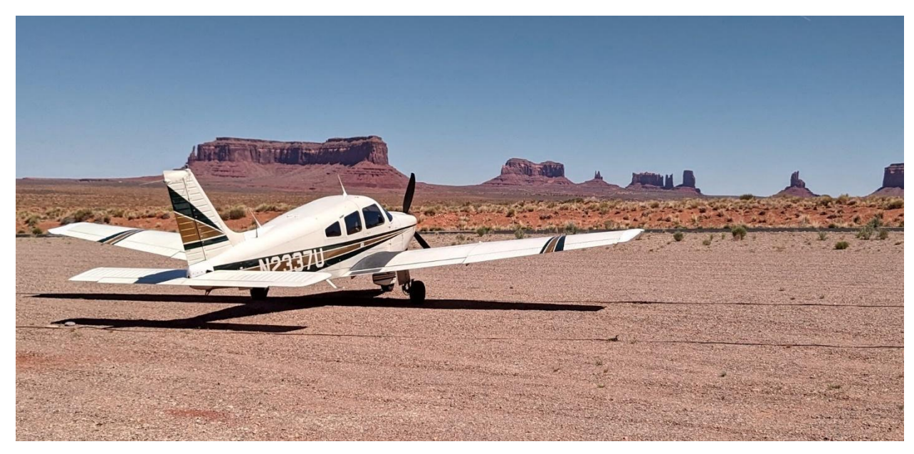
Airstrip at Gouldings Lodge, Monument Valley

From the airstrip it's a short walk uphill to the decent diner with fantastic views. Returning to the plane after lunch, we pushed & pulled it off the gravel (to avoid flying rocks when we started the engine), then continued our trip toward Cortez (CEZ), in the Four Corners area near Mesa Verde NP.