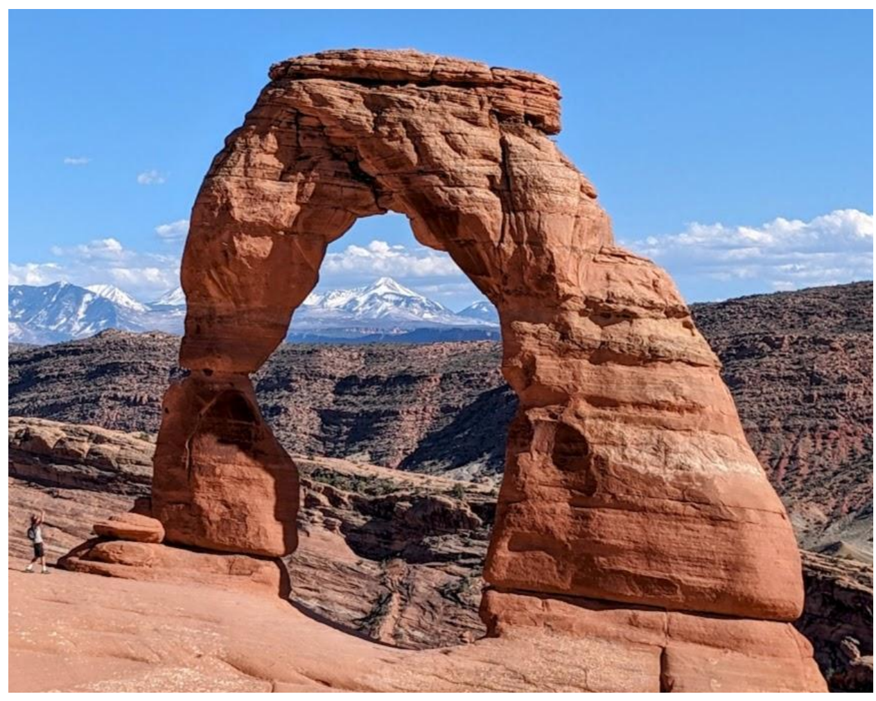
Delicate Arch, Mt Waas in the background.

Crossing into Arizona with the clouds getting thicker and after flying through some green and yellow on the Nexrad map, we saw an approaching wall of rain. I could probably have descended to keep ground visibility, but instead I got a pop-up IFR clearance to take us through what turned out to be a pretty mild (cold?) front. After getting through the rain, the sky was completely clear and I canceled IFR. Nearing LAS we were cleared into the Bravo and vectored around to the southeast. We stayed high until we crossed a ridge between Boulder City and Henderson (imaginatively called "The Ridge" and topping out over 5K), after which I chopped and dropped to get down to Henderson at 2500'.