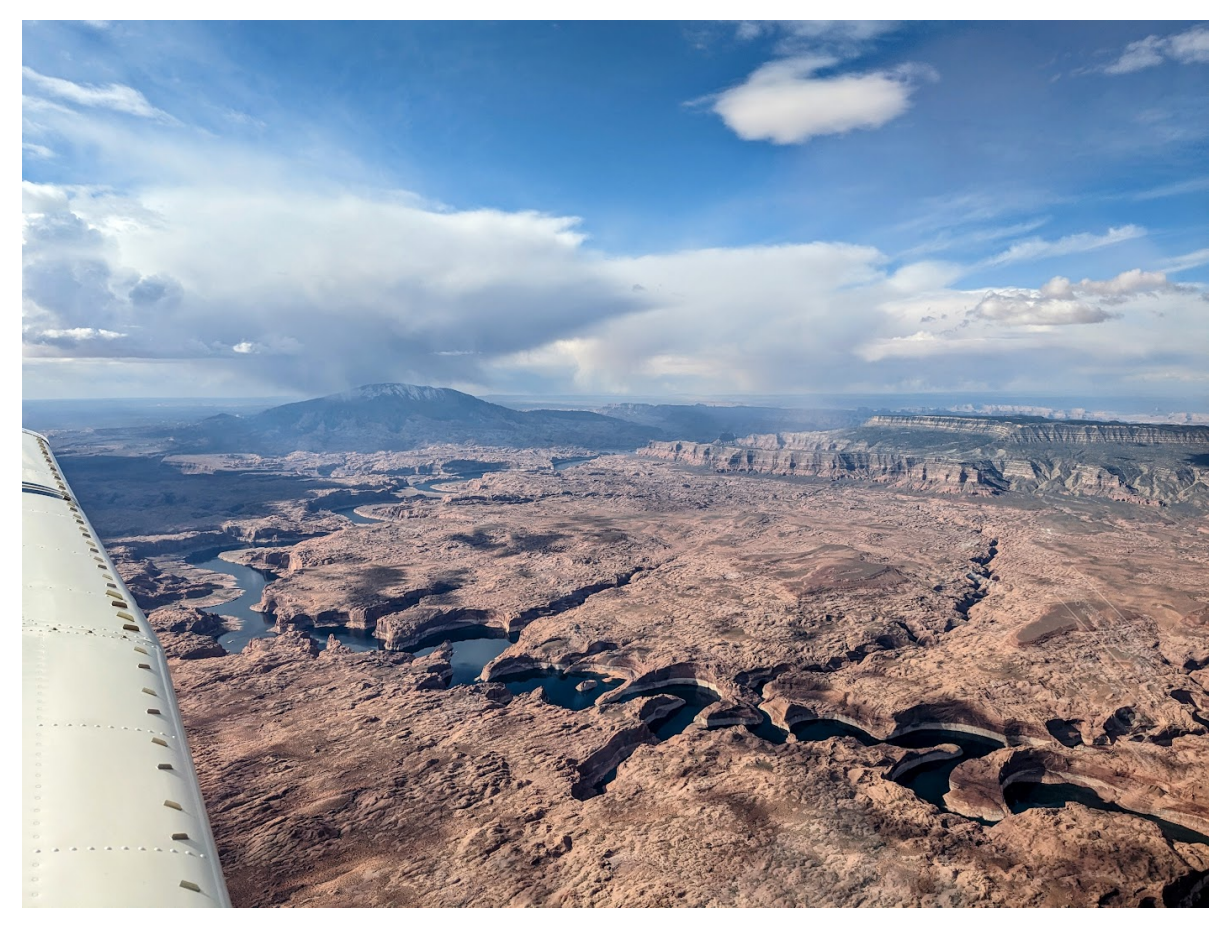
A northern tributary of Lake Powell.

HND is a busy GA airport with lots of jets parked on the ramp. I had been in touch with a ski buddy (SH) who lives there (working in what they euphemistically call "gaming") and who came out to the FBO with his boss to meet us. The boss owns a C210 parked at HND and likes the café above the FBO so that's where we had lunch. The boss was very interested in the aviation details of our adventure and shared his favorite destinations, which included Big Bear – a bit far from the Bay Area but one I'd like to visit.