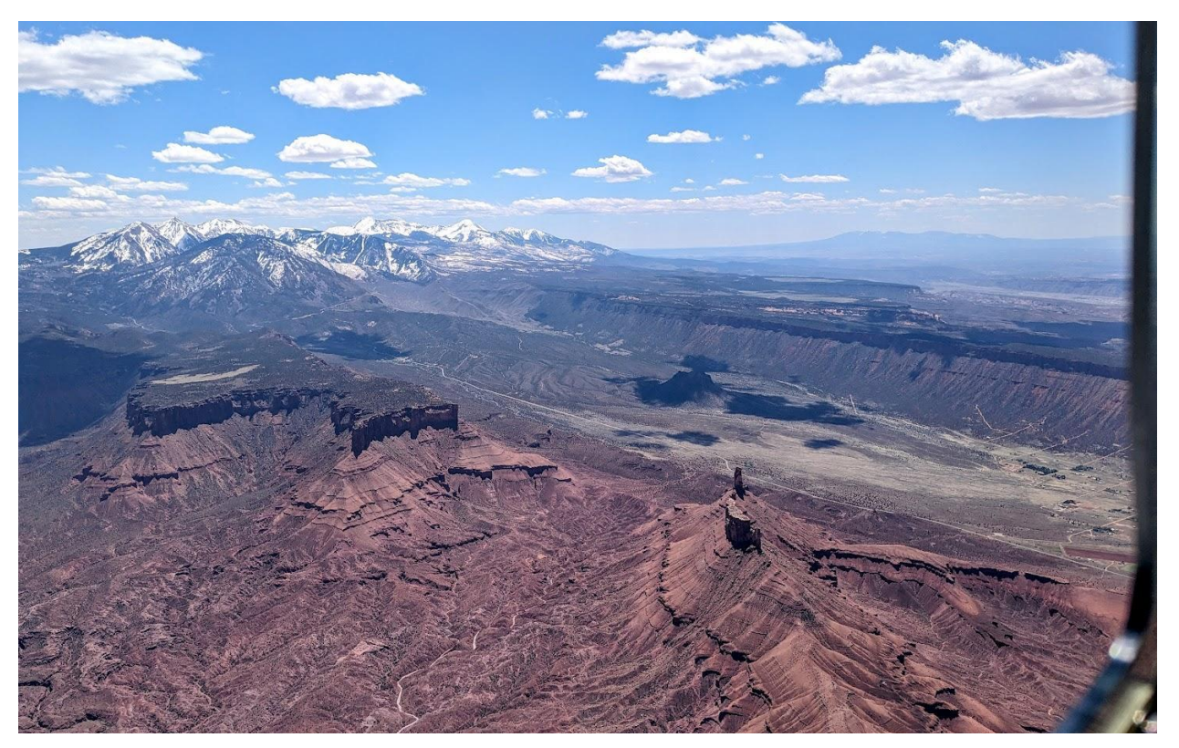
Somewhere east of Arches NP, looking south.

failed takeoff from turning into a nosedive off the edge. After getting out of the canyon we turned further north to pass by Grand Junction and over the Black Ridge Canyon wilderness. This took us up towards a very rugged landscape northeast of Moab, where the Colorado and its tributaries have cut deeply into the terrain. The snow-capped Mt Waas and Peale form a striking backdrop to the stark scenery. I appreciated that I was using GPS as we flew past Mt Waas.<sup>1</sup>