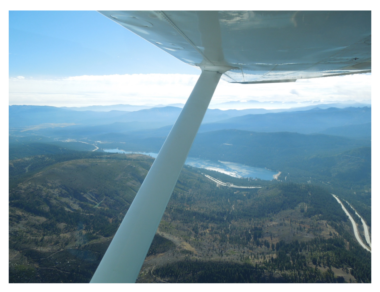
Donner Lake and KTRK in the distance