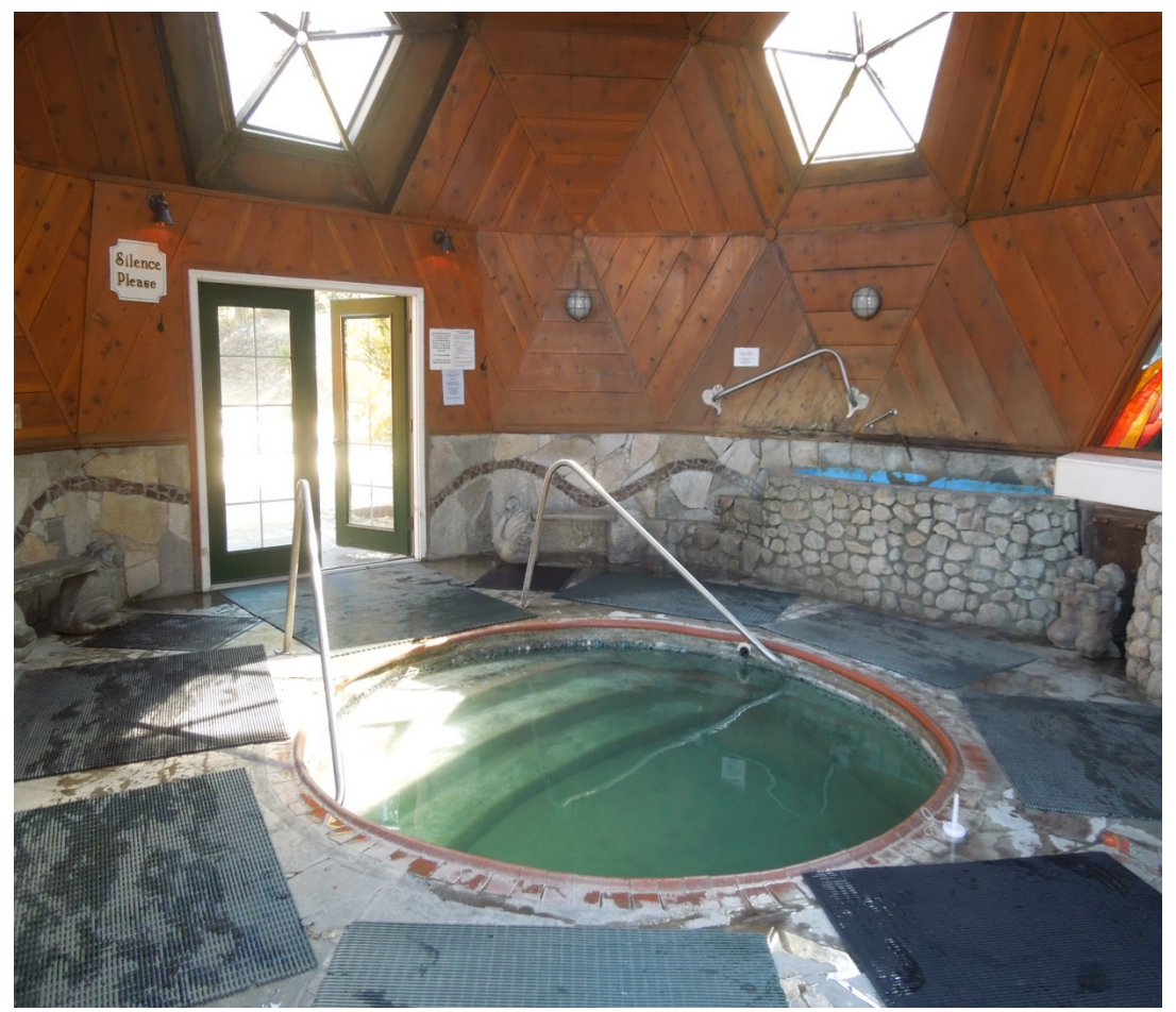
Geodesic dome and hottest pool.