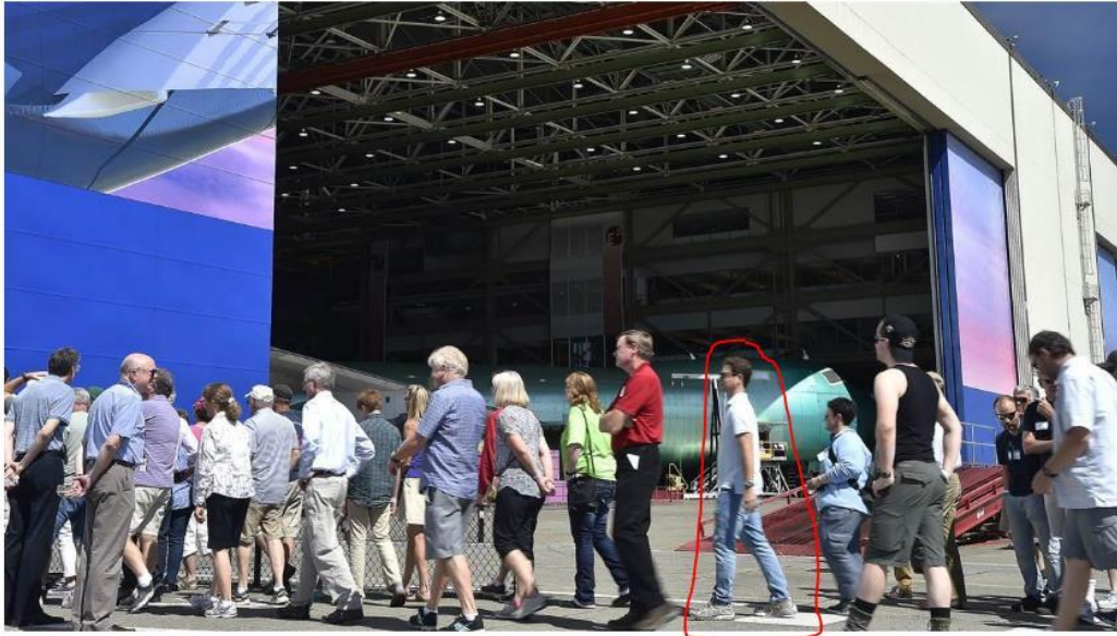
A Boeing 747 under construction in a cavernous hangar frames attendees at Paine Field in Everett, Washington, during a special VIP tour for the AOPA Fly-In at Bremerton, Washington, Aug. 19.