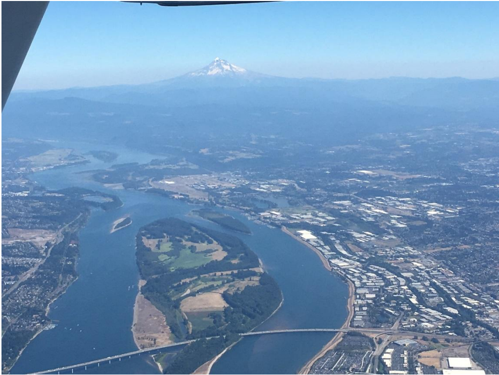
After refueling in Eugene, I was able to proceed directly over Portland.