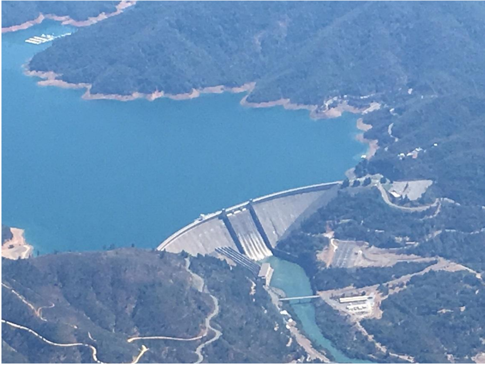
Lake Shasta Dam