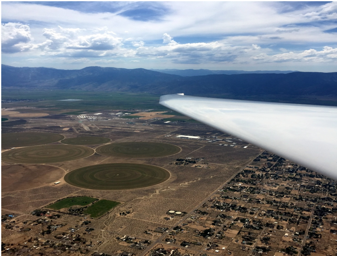
Minden-Tahoe Airport in the Carson Valley.