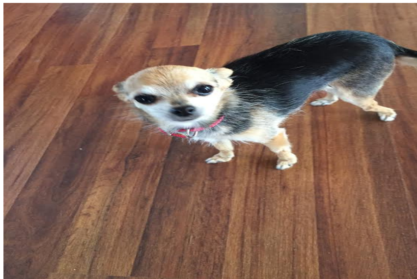
The FBO dog at SoaringNV. "Winglet", also known as "Trim Tab". He's owned by a tow pilot.