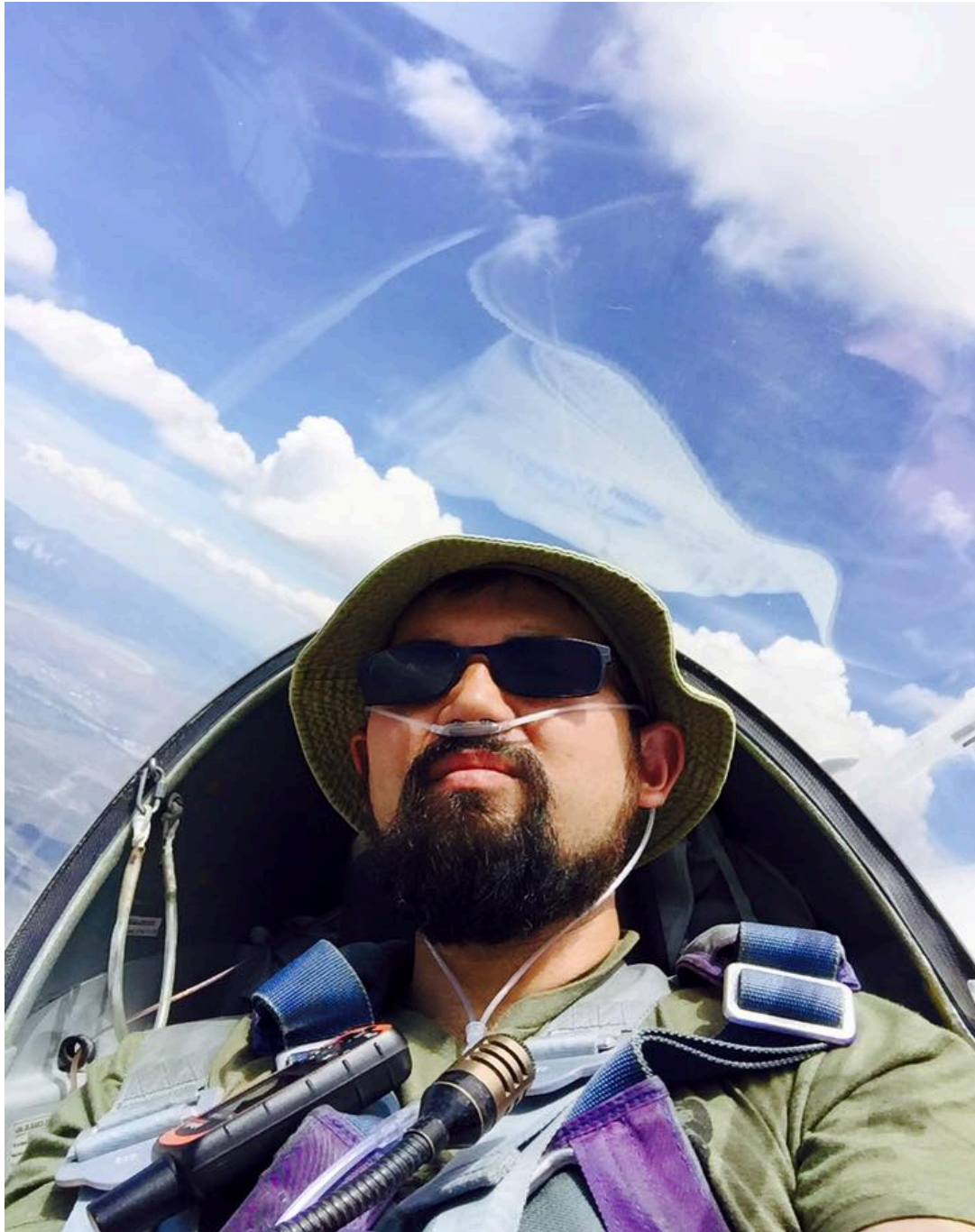
Flying the Discus at 13k feet with oxygen, an InReach transceiver and a parachute.