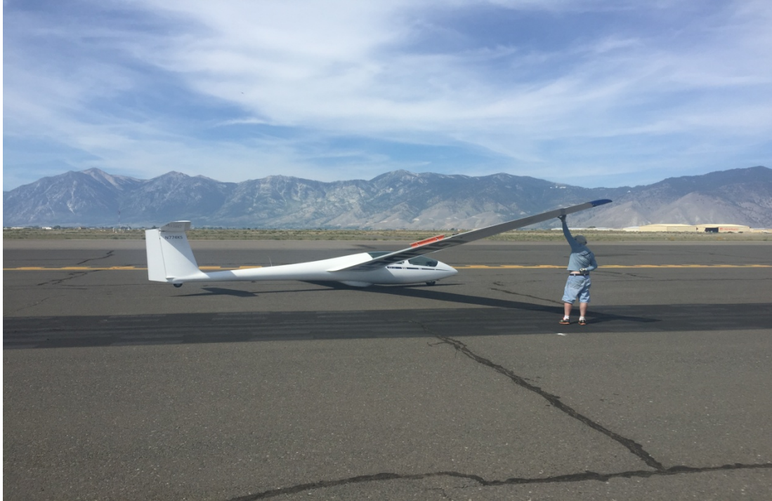
This is an ASK-21, the primary instruction type at SoaringNV. It has a 35:1 glide ratio